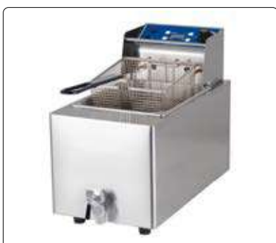
Single Fryer 1001003