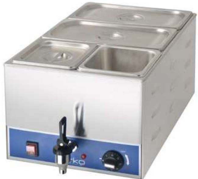
Note: pans & lids are not included