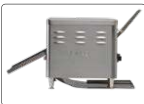
Toaster opening sizes : 260mm x 60mm