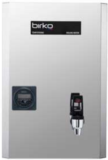
110076 with optional timer.