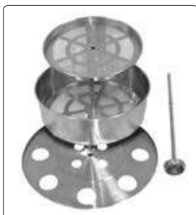
Internal parts for 20 L model