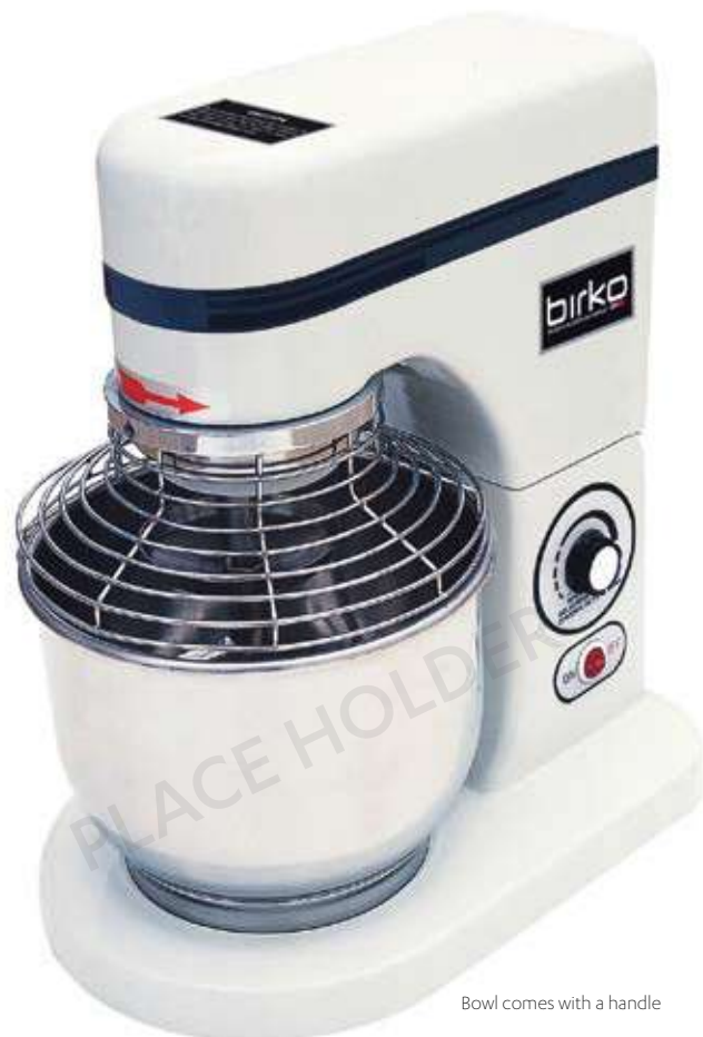
Bowl comes with a handle