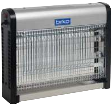
Insect Killer Model 1004108