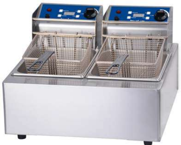
Double Fryer 1001002