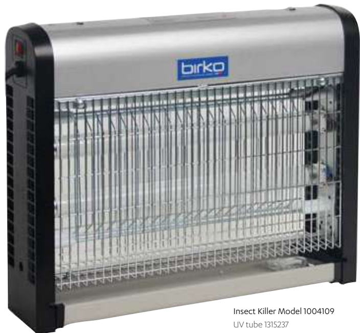
Insect Killer Model 1004109