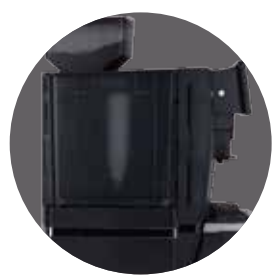
Optional filter connector for Swiss Aquis 150L water filter