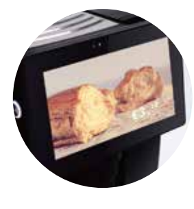
Easily upload customized videos from U Disk for brand promo & Ads